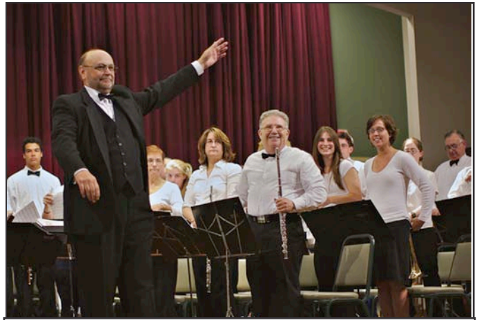
The band receives a well-deserved standing ovation at the conclusion of the 40th Anniversary Concert